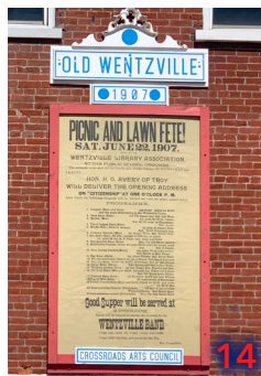
14. 2 Main Street