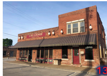
13. 107 S. Linn Avenue