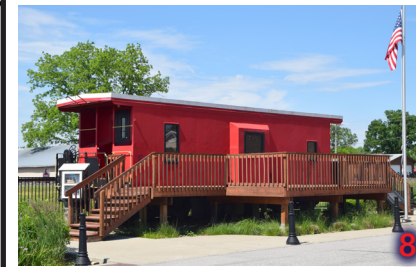
8. East Main Street, across from S. Talley St.