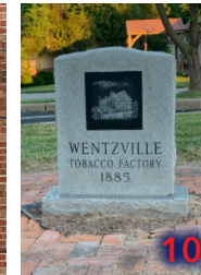
9. E. Main Street, across from Friendship Brewery entrance 10. South Elm, between 4th & 5th Streets