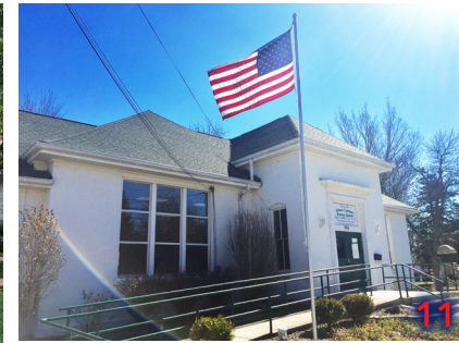
11. 506 S. Linn Avenue