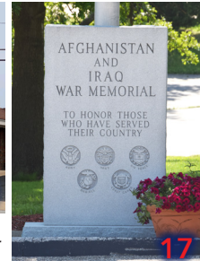
17. 500 W. Main Street