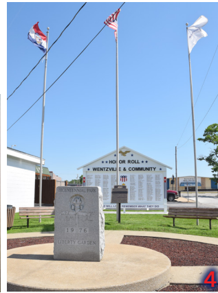
4. 22 W. Pearce Boulevard (left & below)