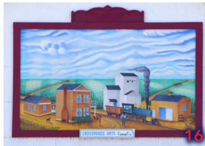
16. Across the street from 210 W. Main Street