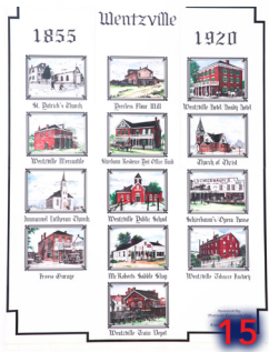
15. 112 W. Main Street