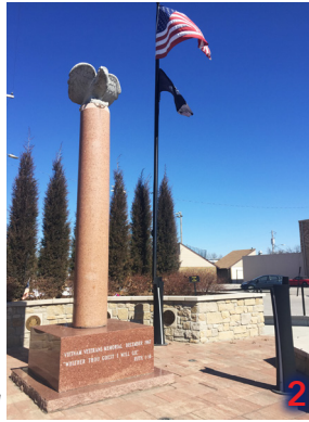
2. 209 W. Pearce Boulevard