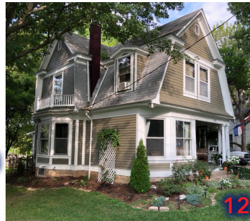
12. 521 S. Linn Avenue