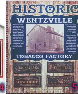
5. Side of 1 E. Allen Street 6. 201 E. Pearce Boulevard