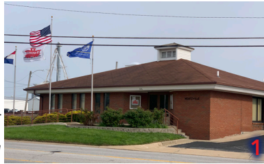
1. 310 West Pearce Boulevard